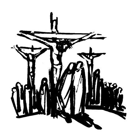
We keep silence